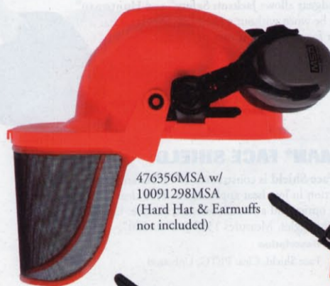
476356MSA w/ 10091298MSA (Hard Hat & Earmuffs not included)