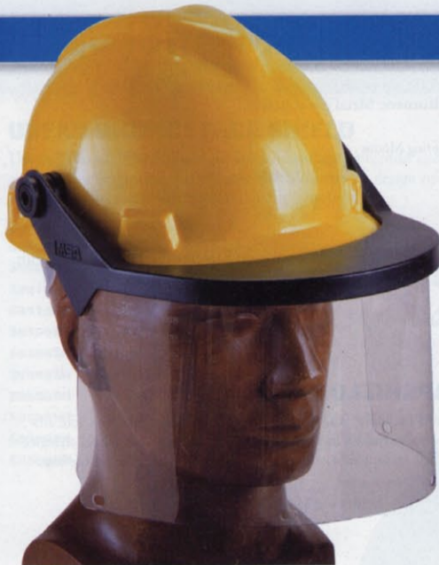
10021614MSA w/ 488131MSA (Hard Hat not included)