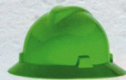
Bright Lime Green