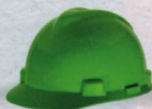
Bright Lime Green